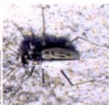
Northeastern beach tiger beetle

Piping plovers and roseate terns are not the only federally protected species to receive attention from refuge staff. In 2000, 23 northeastern beach tiger beetle larvae were collected from a Martha's Vineyard beach and successfully re-located to Monomoy. The federally protected tiger beetle has been on a downward population trend because of impacts by off-road vehicles and beach habitat manipulation (e.g., construction of seawalls and jetties). Once found in "great swarms" along coastal beaches from Virginia to southeastern Massachusetts, only three populations of tiger beetles currently exist north of Chesapeake Bay.