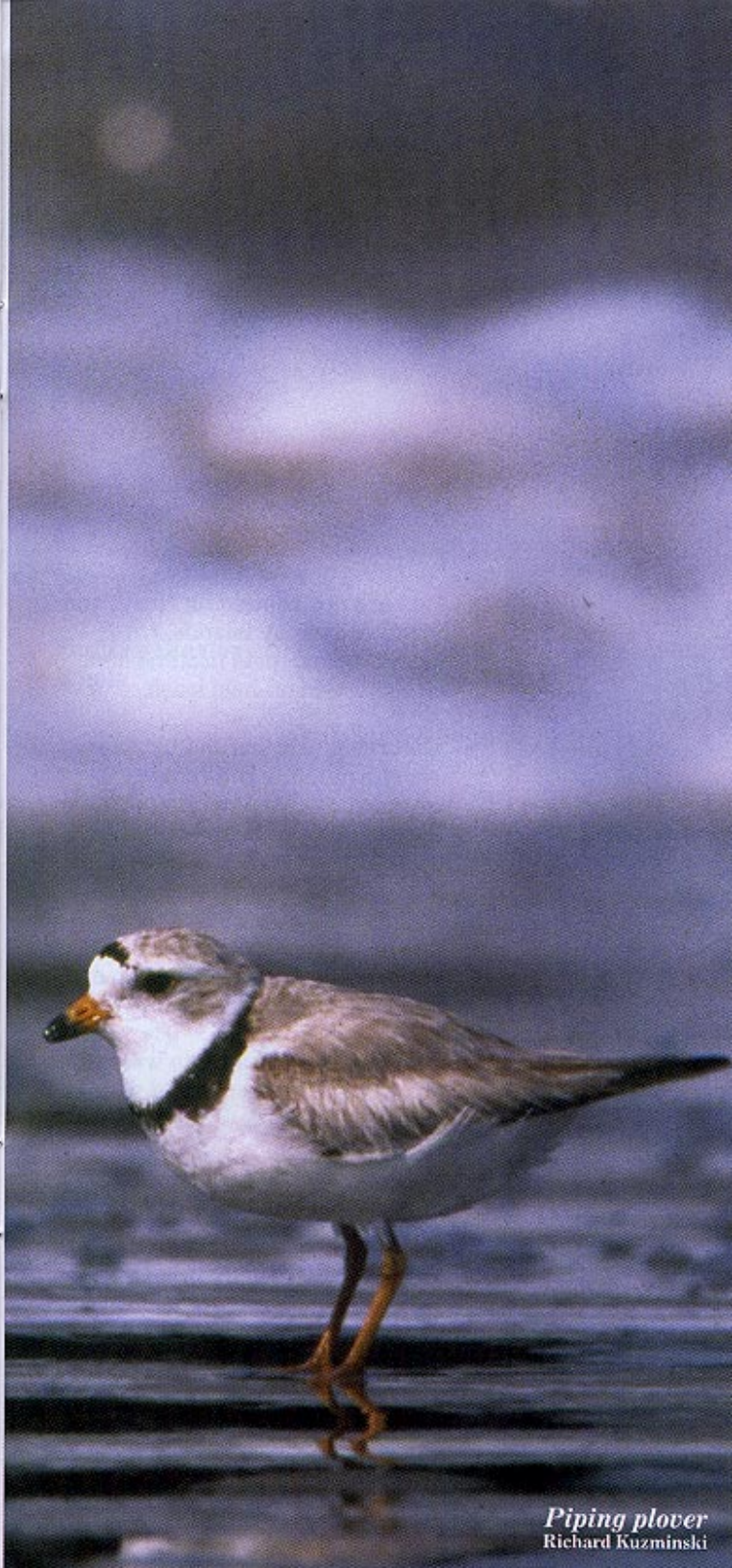
Piping plover