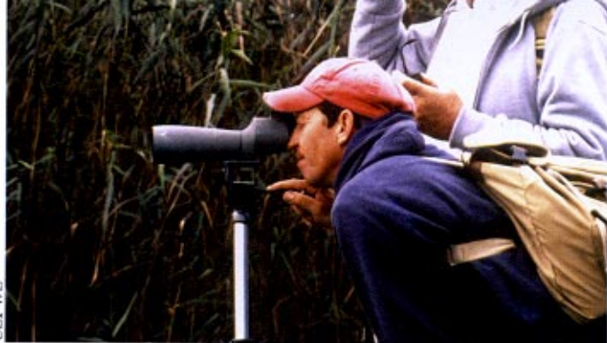
Birdwatching on Monomoy

The refuge headquarters and visitor center are located on Morris Island. Exhibits, informative brochures, and a bookstore are available. The visitor center is open seasonally; call ahead