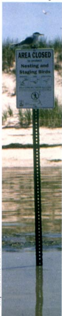
Area closed sign

Remember to take only memories and leave only footprints.