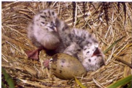
Laughing gull chicks

Beginning in late July, shorebirds spotted on Monomoy include turnstones, sanderlings, least and semi-palmated sandpipers, black-bellied and semi-palmated plovers, dowitchers, red knots, dunlin, roseate terns, American oystercatchers and whimbrels. Some uncommon shorebirds seen in late summer,